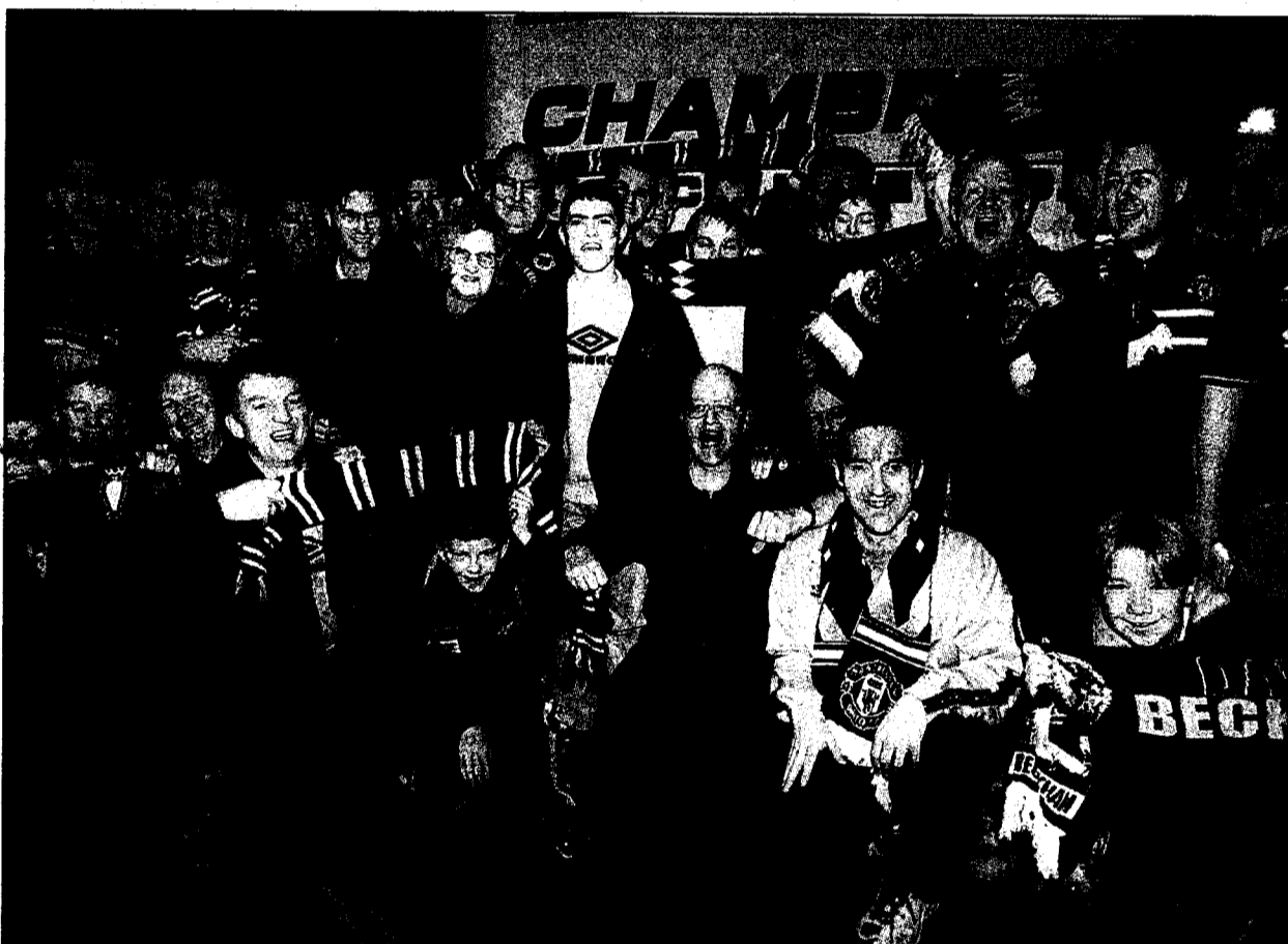
Eighty members from the Carryduff Manchester United Supporters Club had an early start for tonight's big match.

THE Government wants all of Ulster's health boards scrapped as part of the biggest NHS shake-up for more than 40 years, the Belfast Telegraph can reveal today.